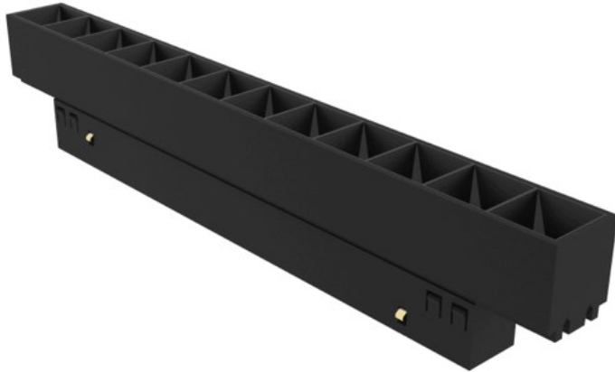
Dimension by mm.