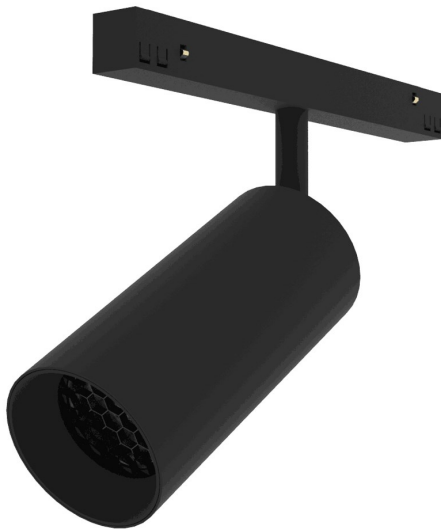
Dimension by mm.